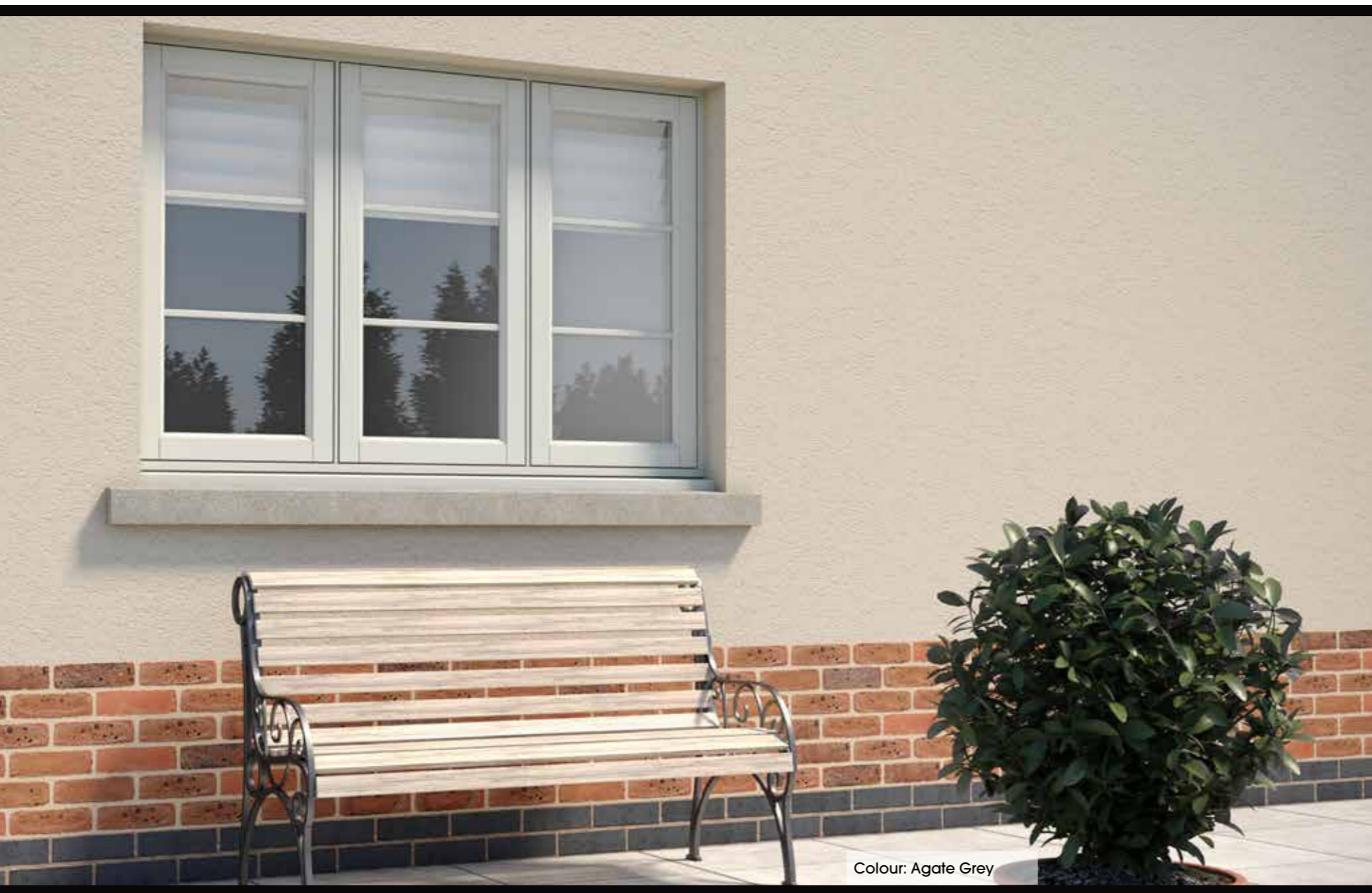
Colour: Agate Grey